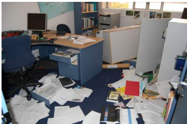
Ian's office after February 22 Earthquake

that building again, and it remains to be seen if we will be able to rescue much if anything beyond the computers and servers that have been retrieved by special teams. A quick trip home revealed less and less damage when travelling west, and no injury and repairable damage at home. Ian is currently working mainly from home.